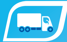
Diesel / LPG Mix