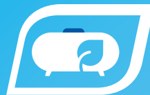
Oil to LPG