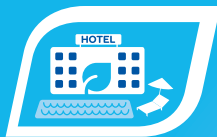
Hotel & Leisure