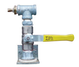
In the 'on' position